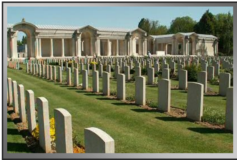
ARRAS MEMORIAL WITHIN FAUBOURG D'AMIENS CEMETERY

The Arras Memorial within Faubourg d'Amiens Cemetery commemorates almost 35,000 servicemen from the United Kingdom, South Africa and New Zealand who died in the Arras sector between the spring of 1916 and 7th August 1918 (the eve of the Advance to Victory) and have no known grave.