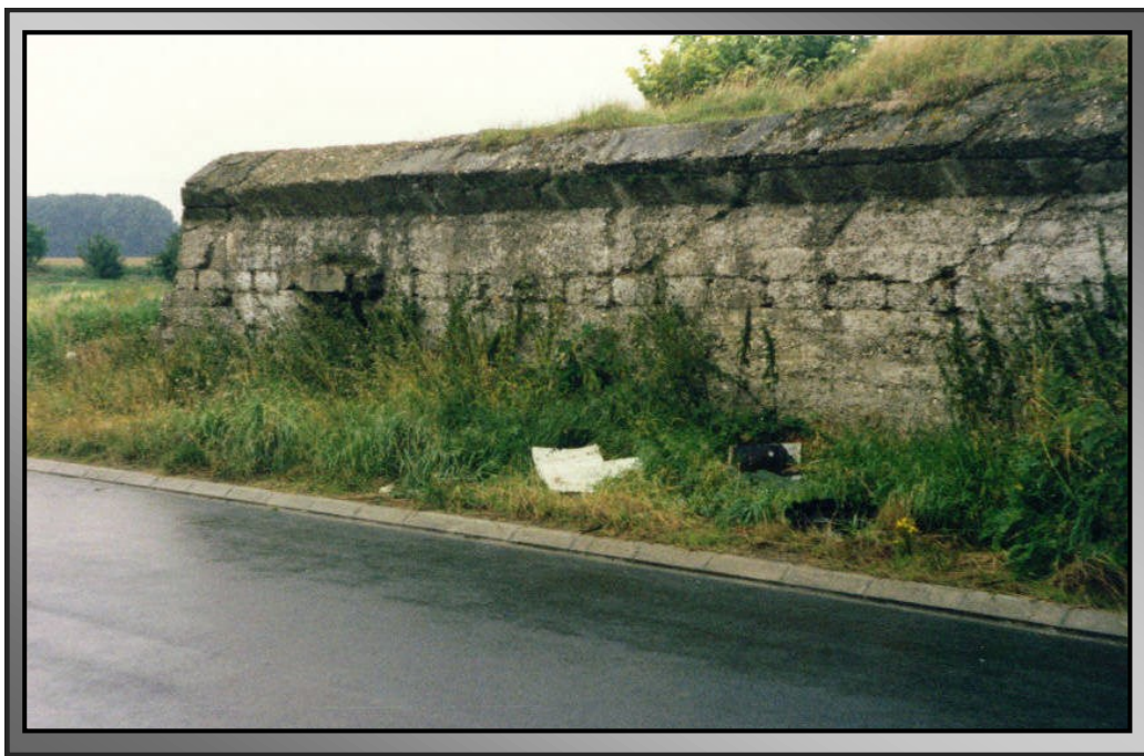
GERMAN CONCRETE BUNKER NEAR ROEUX